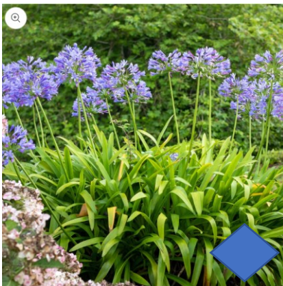
Dwarf Lily of the Nile (1Ga)

Boxwood (Green) in the back The purple Flowers with the white Wax Begonia "Dome" And then the Maple trees (Green on the edge and the red on the inside)